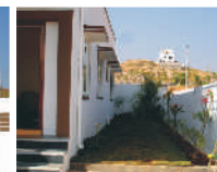
ACTUAL PHOTOGRAPHS FROM SITE

BUILD LIFESTYLE VILLAS IN READymADE INFRASTRUCTURE